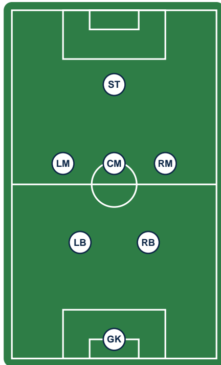
7v7 — 2-3-1

The U9–U10 standard: solid base, a midfield 3, one striker.