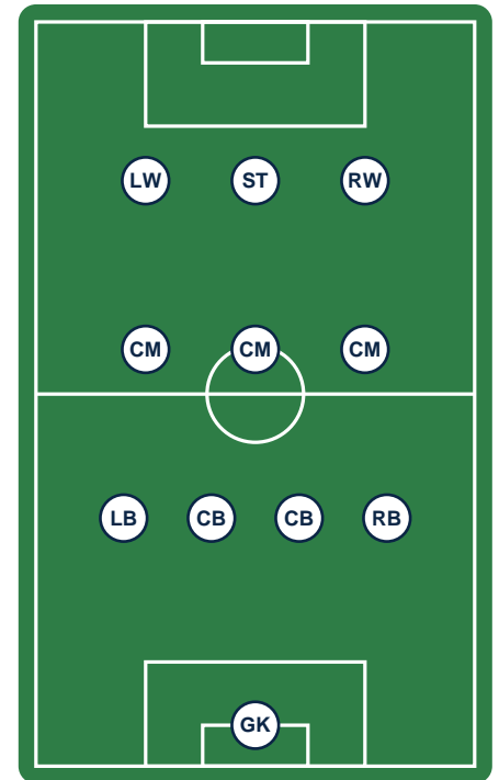
11v11 — 4-3-3

The full-field classic: back four, midfield triangle, front three.