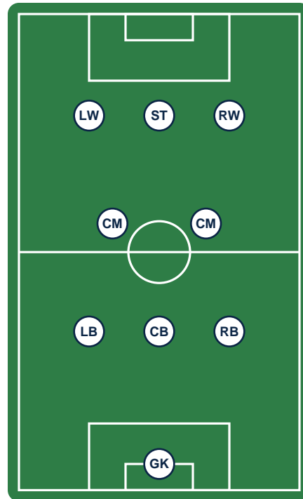
9v9 — 3-2-3

The U11–U12 favorite: three at the back, wide attackers.